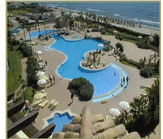
Marriott's Marbella Beach Resort Marbella, Spain

The RDA RESERVE MANAGEMENT SOFTWARE™, first developed in 1980, was the first of its kind and has since become the most widely used reserve analysis program in the industry. The program is not a spreadsheet, but rather a fully-integrated management, computational and projection tool. The software is complete with a built-in database of costs and typical useful life ranges on over 2,000 components.